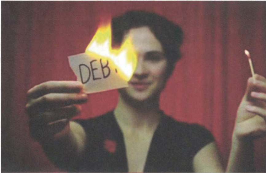
Strike Debt, PSA - Public Service Analysis: What Is the Rolling Jubilee?, 2012 (still). Video, sound, color; 1:57 min.